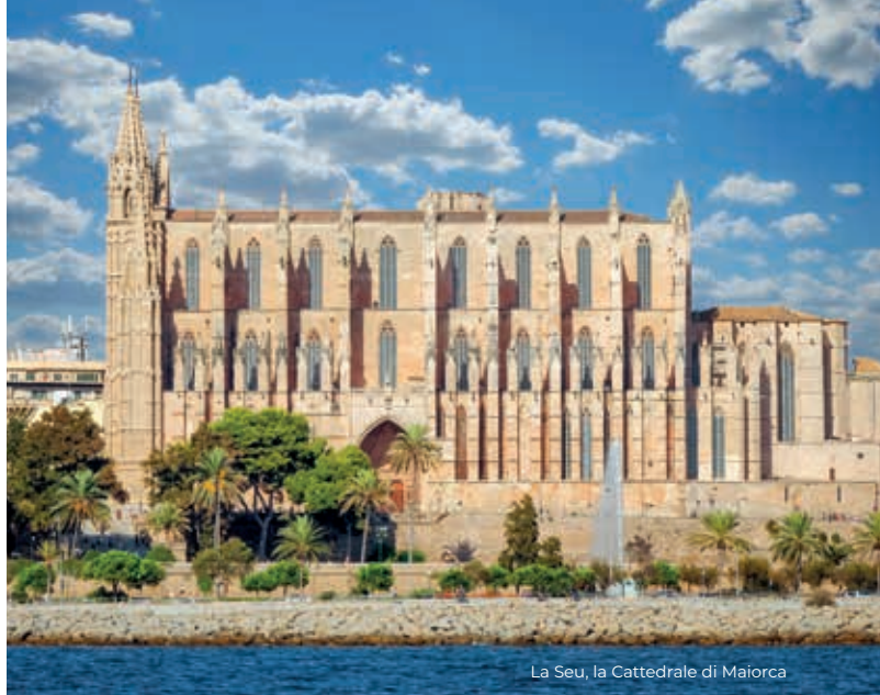
La Seu, la Cattedrale di Maiorca

“ Recommended Restaurants and Activities ►